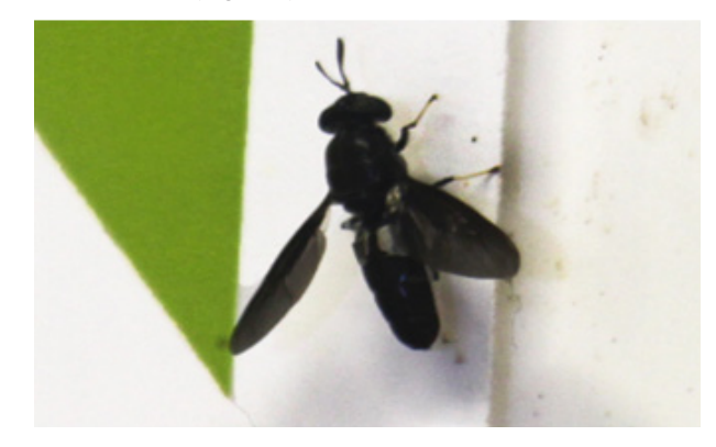
Figure I Adult Black Soldier Fly.

(more than a quarter), and therefore one of its virtues: that of not constituting a health hazard (or even a nuisance) for humans and domestic animals (Figure 2).