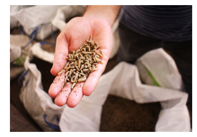
Figure 2 Black Soldier Fly larvae.

But, although this is not of minor importance, it is, nevertheless, the larval phase that is preponderant in the economy of agricultural,