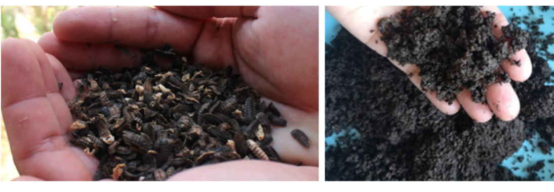
Figure 3 Pupae (on the left) and fresh frass (on the right).

In addition, BSF, in its pre-pupal phase, abandons the composted substrate, migrating to clean places (a phenomenon that is referred to in the scientific literature as self-harvesting), individualizing, without added costs, two distinct products of remarkable economic value. In particular (Figure 3):